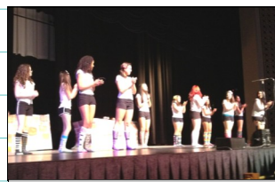
The Homerettes do a few dance routines during the play.