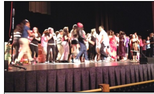
The cast celebrates with a dance at the end of the play.