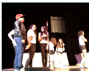
The cast looks on during a silly scene in the play.

out my horse, and I got to act like a kid."